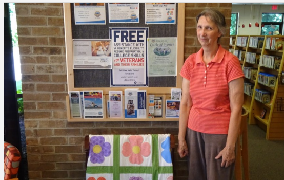
Quilt Fundraiser in in September of 2018