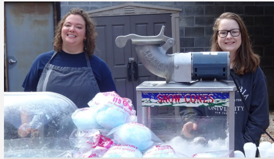
Westernport Community Day in October of 2017