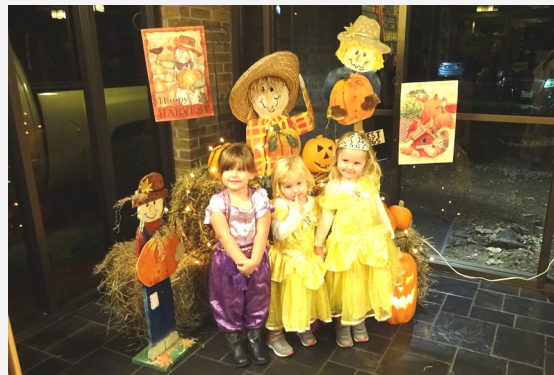
Halloween Movie & Party in October of 2018