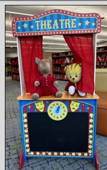
We purchased the kitchen set and the puppet theater.