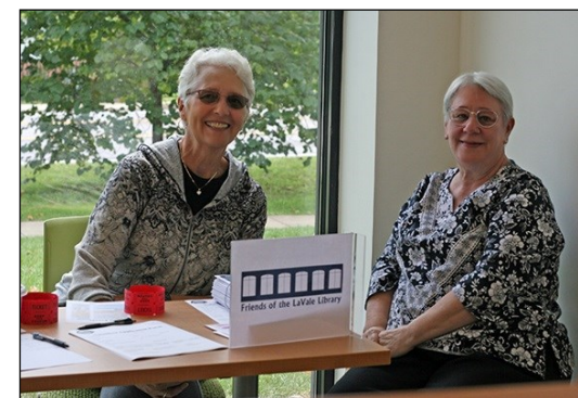
The information table during the LaVale Library Grand Reopening