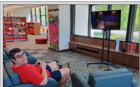
We purchased a PlayStation for the Reading Room