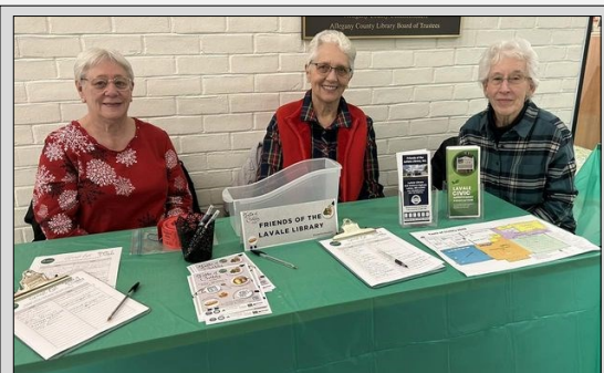
Our Friends at the welcome table during the Taste of Civility